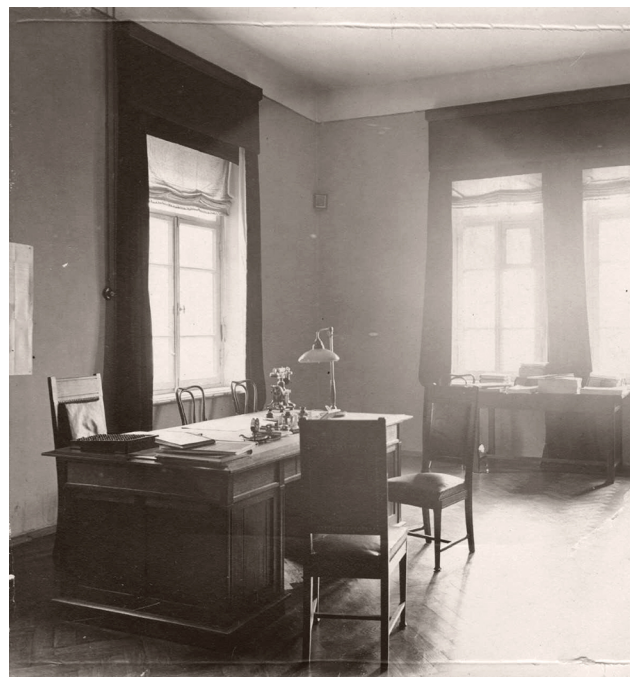
Figure 12. Moscow territorial hospital. Chief physician's office.