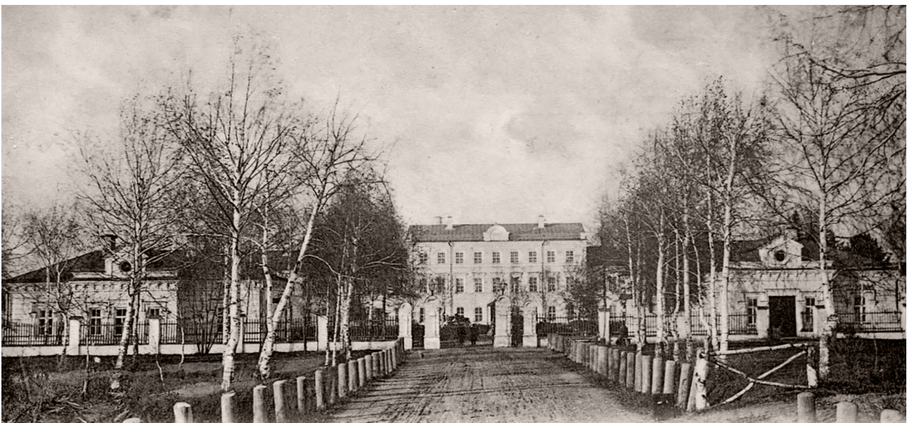
Figure 1. The Territorial hospital for the mentally ill in Kazan.