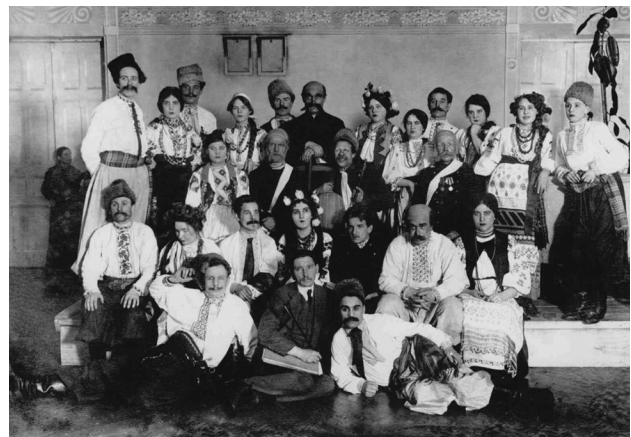
Figure 9. Participants in amateur performances after the show.

Time itself called for the establishment of a psychiatric hospital of such type. By 1907, the medical institutions of the Russian Empire had begun increasingly admitting patients convicted of various criminal offenses, and zemstvo hospitals had been instructed to admit them unconditionally. As a result, beds for other patients became scarce. A commission including the prominent psychiatrists Merzheevsky I.P., Bekhterev V.M., and Krainsky N.V. came to the conclusion that care of the mentally disturbed needed to be differentiated. Acute mentally disturbed patients and those constituting no threat to the public with chronic diseases remained under the care of the zemstvo, while a decision was made to move patients awaiting testing, prisoners, and patients constituting a public danger with chronic diseases into territorial hospitals. Therefore, the Moscow and Tomsk hospitals were built with account of the need of the state to sequester people who were deemed to be a threat to society and could not be placed in ordinary prisons due to their mental condition.