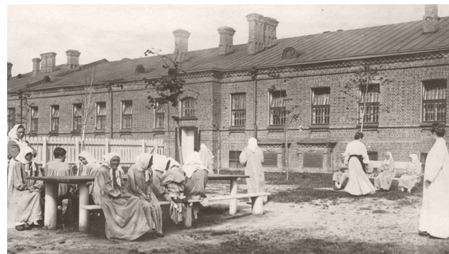
Figure 11. Moscow territorial hospital. Patients taking a walk, 1910.

In 1908, a school was opened on the second floor of this tower for the children of the hospital personnel. This was because at the beginning, a significant part of the hospital personnel were employees of the Vinnitsa hospital who had followed the director, along with their families. Since there were not enough room in the zemstvo school, a school was established for the children of doctors and residents right on the premises of the hospital. Adjacent to the tower was a household utility building with a kitchen, a bakery, a canteen for employees, a bathhouse, a laundry, a sewing workshop, and disinfection rooms. Like other territorial hospitals, the Moscow hospital had its own power plant. Owing to that plant, not only the entire hospital town, but also part of the road to the station was illuminated.