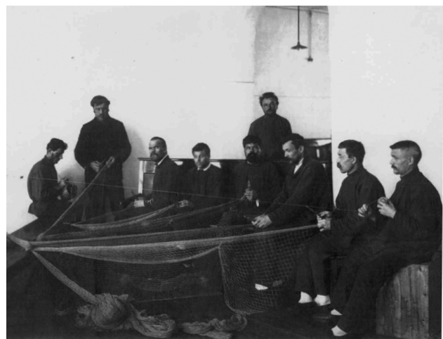
Figure 8. Patients of the Tomsk territorial hospital busy weaving fishing nets.