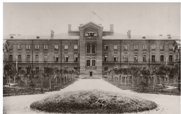
Figure 10. Moscow territorial hospital, 1910.

The need to build a territorial psychiatric hospital near Moscow becomes particularly obvious if one turns to the testimonies of contemporaries. One of the petitions to the government at the time stated that the mentally ill were brought to Moscow from almost all over Russia and abandoned to their fate on the streets or at railway stations. The dangerous acts they committed caused escalation of public tension. It was obvious that such patients were in need of special care and treatment. To solve the problem, the Tsar's government decided to purchase the territory of the former estate of the Obolensky princes in the village of Troitskoye, Molodinskaya volost, Podolsky district, and build a prison-type territorial psychiatric hospital. Despite the stated purpose of the establishment, the building was kept in the original spirit of the project: a picturesque area with beautiful groves, ponds, and a river; a completely autonomous farmstead; living conditions for doctors and the caretaking personnel right on the premises; and division into buildings, of which only four departments were intended for "criminal" patients. The small gardens