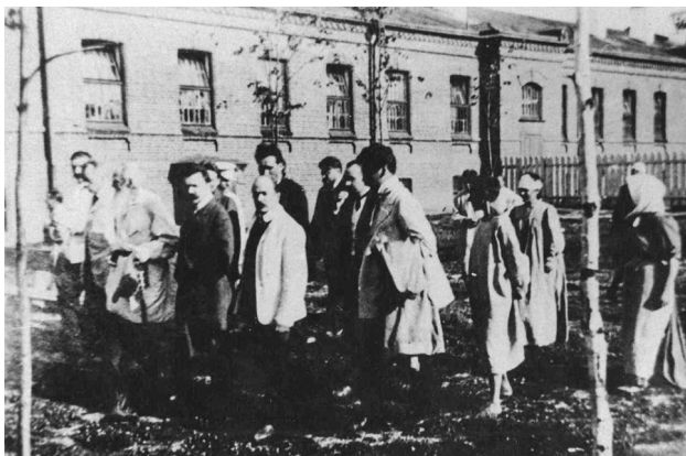
Figure 13. Tolstoy L.N. visits the Moscow hospital.

At the site of the DMSR, three sewing workshops were launched, with a total of 50 stations, which makes it possible for a large number of patients to immerse in occupational therapy. Many of them underwent professional training during their treatment and thereby gave themselves the opportunity for further employment.