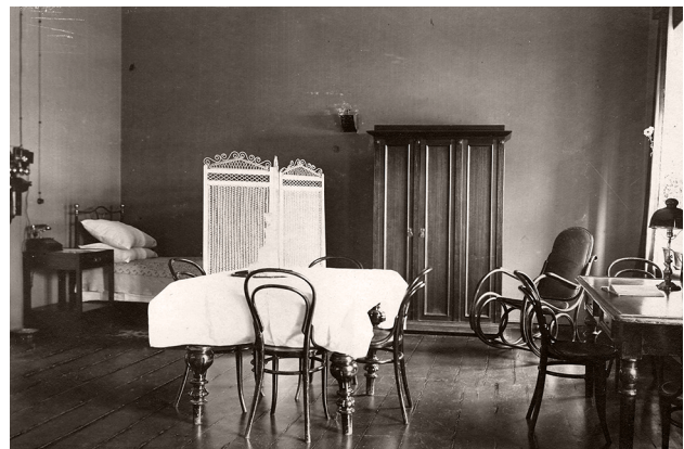
Figure 14. Moscow territorial hospital. Duty doctor's room.