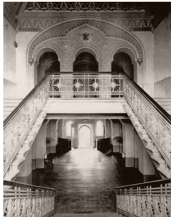
Figure 5. The main staircase of the Tomsk territorial hospital.