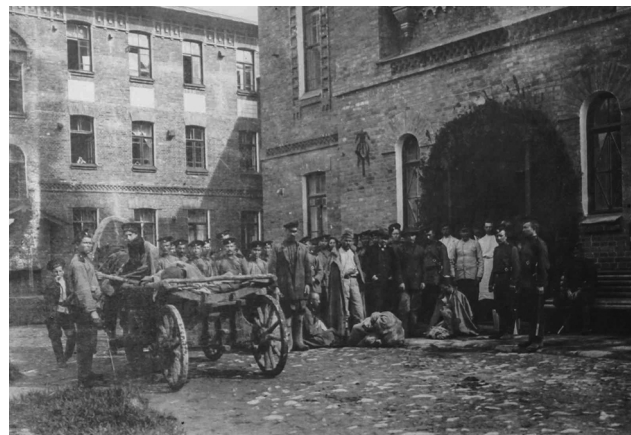
Figure 6. Arrival of patients at the Tomsk territorial hospital.