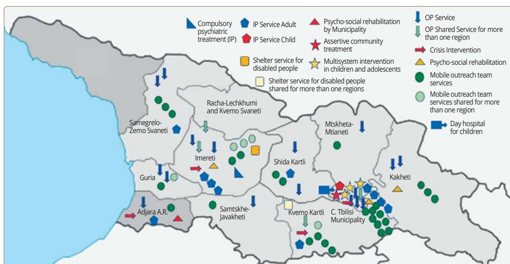
Figure 1. Cartography of Mental health service provision in Georgia.

The aim and procedures of the study were clearly described to the participants. All participants signed the informed consent.